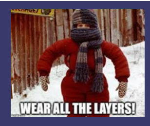
Cold weather is back! Make sure your child is dressed in warm winter clothing for outdoor play!